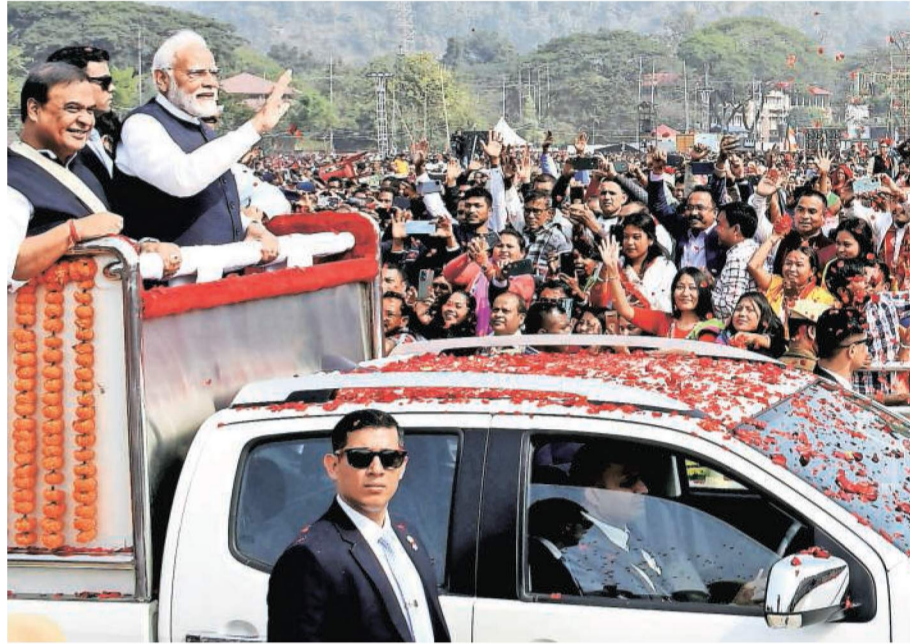
PM Narendra Modi and Assam CM Himanta Biswa Sarma in Guwahati on Sunday.

At the event Modi said, "After the Kashi corridor was made, a record number of devotees reached there. (A total of) 8.5 crore people went to Kashi last year... More than 19 lakh people went on pilgrimage to Kedarnath. In Ayodhya, the Pran Pratishtha (of Ram Lalla) was done just a few days ago. In 12 days, more than 24 lakh people have had a darshan. After the Maa Kamakhya Divyalok Pariyojana is made, we will see a similar sight here."